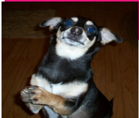
Just One More Please???

Sales tax will be added to all purchases.