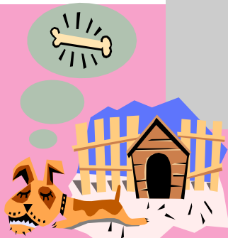
Dreaming of a Dog-E-Bone

At this time, the biscuits are all bone-shaped for your canine friend. We do have special shapes available that can be requested for pre-orders.