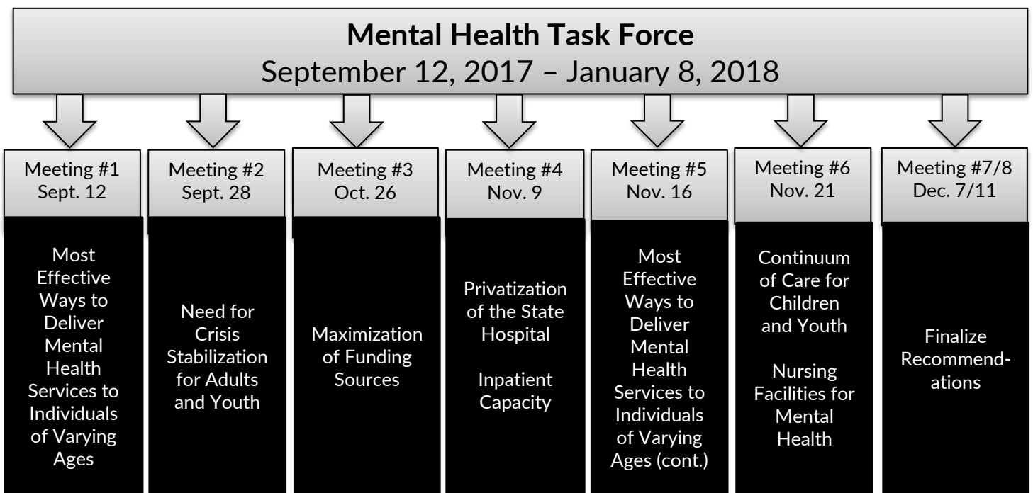
Figure 2. Overview of Mental Health Task Force Meetings by Dates and Topics

The Task Force was convened by the Kansas Department for Aging and Disability Services (KDADS). The Task Force consisted of 11 legislatively appointed members that included behavioral health providers, advocacy organizations, citizens with lived experience, and other behavioral health experts. In addition, the attendees included several KDADS staff members and a representative from the Kansas Legislative Research Department (KLRD). The meetings were facilitated by the Kansas Health Institute (KHI). The role of KHI was to develop and provide materials in advance of the meetings, facilitate discussions, research information, and ensure that the objectives of each meeting had been met.