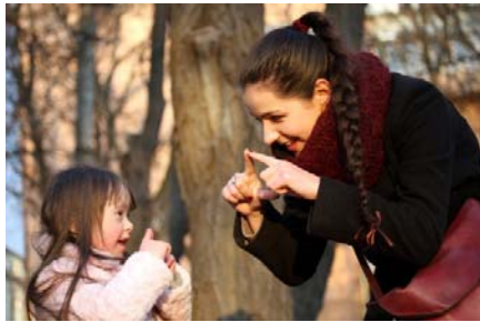
Home and Community Based Services