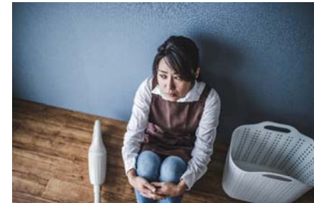
Behavioral Health Services